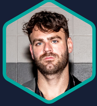
Alexander Pall Artist The Chainsmokers