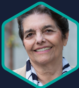
Carlota Perez Economist & Author of 'Beyond the Technological Revolution'