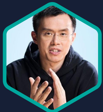
Changpeng Zhao CEO Binance